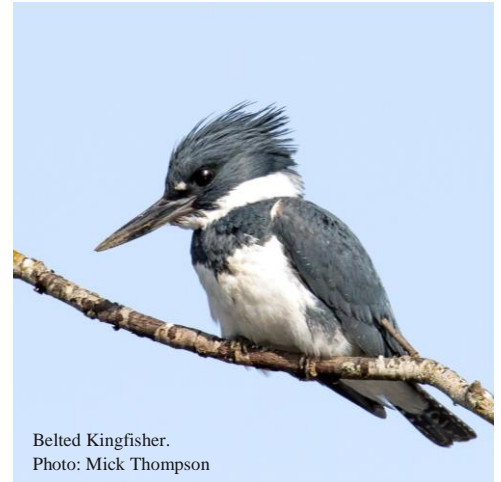
Belted Kingfisher.

The Western Rivers Action Network (WRAN) is Audubon's multi-state grassroots effort to protect rivers across the Colorado River Basin. In the arid West we are all connected by rivers; they are the lifeblood of our land, our economy, our way of life. Western rivers, like the Colorado River and its tributaries, provide water for tens of millions of people, including Native American tribes and the major cities of Albuquerque, Denver, Phoenix, and Tucson. The Colorado River also irrigates nearly six million acres of farms and ranches.