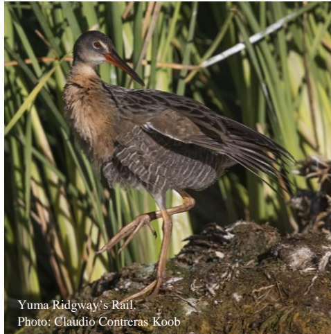
Yuma Ridgway's Rail.