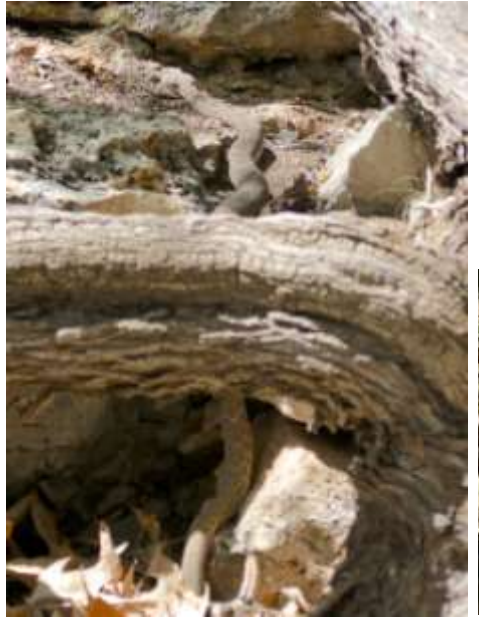
Only full length photo