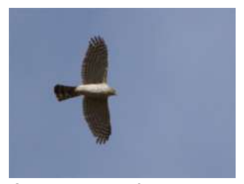
Coopers Hawk in flight