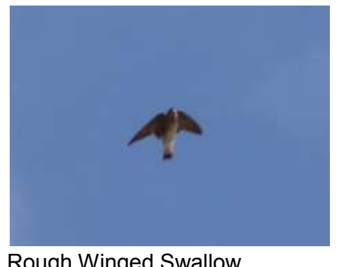
Rough Winged Swallow