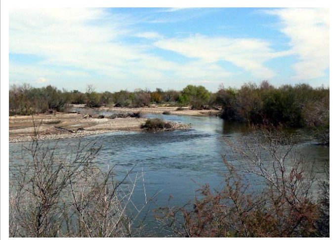
Gila River at Estrella Mountain Park - Tres Rios Festival March 10, 2010

See the website at www.tresriosnaturefestival.com for all the activities, venders, etc.