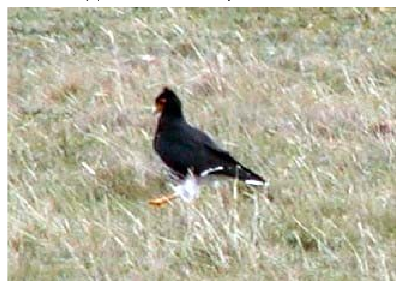
Carunculated Caracara

Caracaras are birds of prey in the family Falconidae. Unlike the Falco falcons in the same family, caracaras are not fastflying aerial hunters, but are comparatively slow and are often scavengers (a notable exception being the Red-throated Caracara). In general, they fill the role of crows or ravens of northern latitudes. The ten species of Caracaras include Black, Red-throated, Carunculated, Mountain, White-throated, Striated, Northern (Crested), Southern, Yellow-headed and Chimango. Caracaras are principally birds of South and Central America, with the Northern Caracara just reaching the southern United States in Arizona, Texas and Florida. On the other hand, the Striated Caracara inhabits the Falkland Islands and Tierra del Fuego, just off the coast of the southernmost tip of South America.