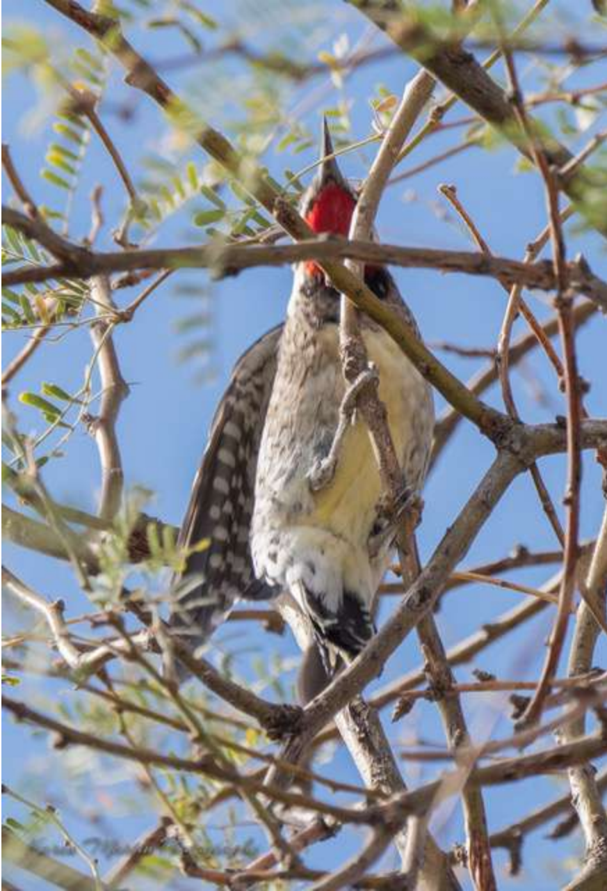
RED-NAPED SAPSUCKER FROM BELOW