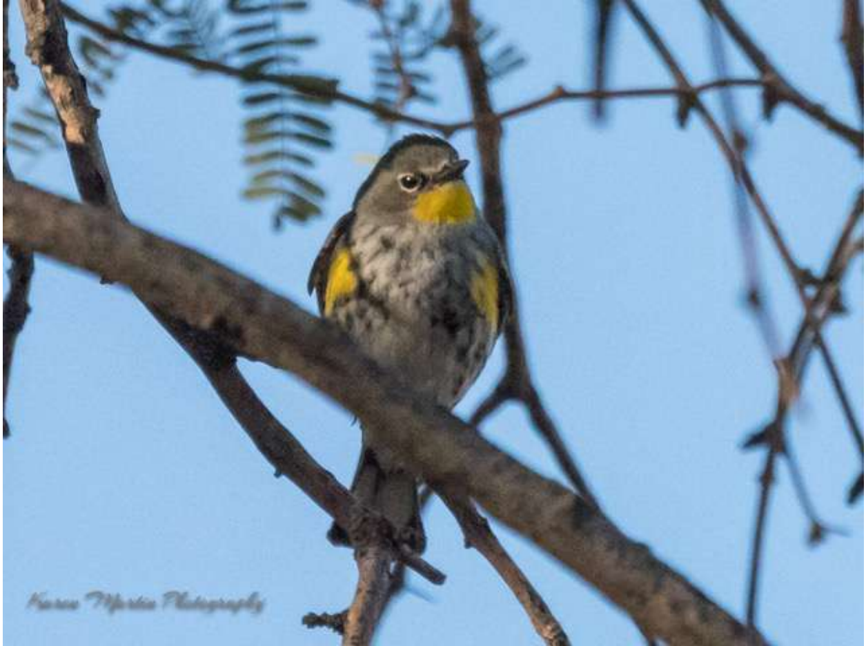
YELLOW-RUMPED WARBLER (AUDUBON)