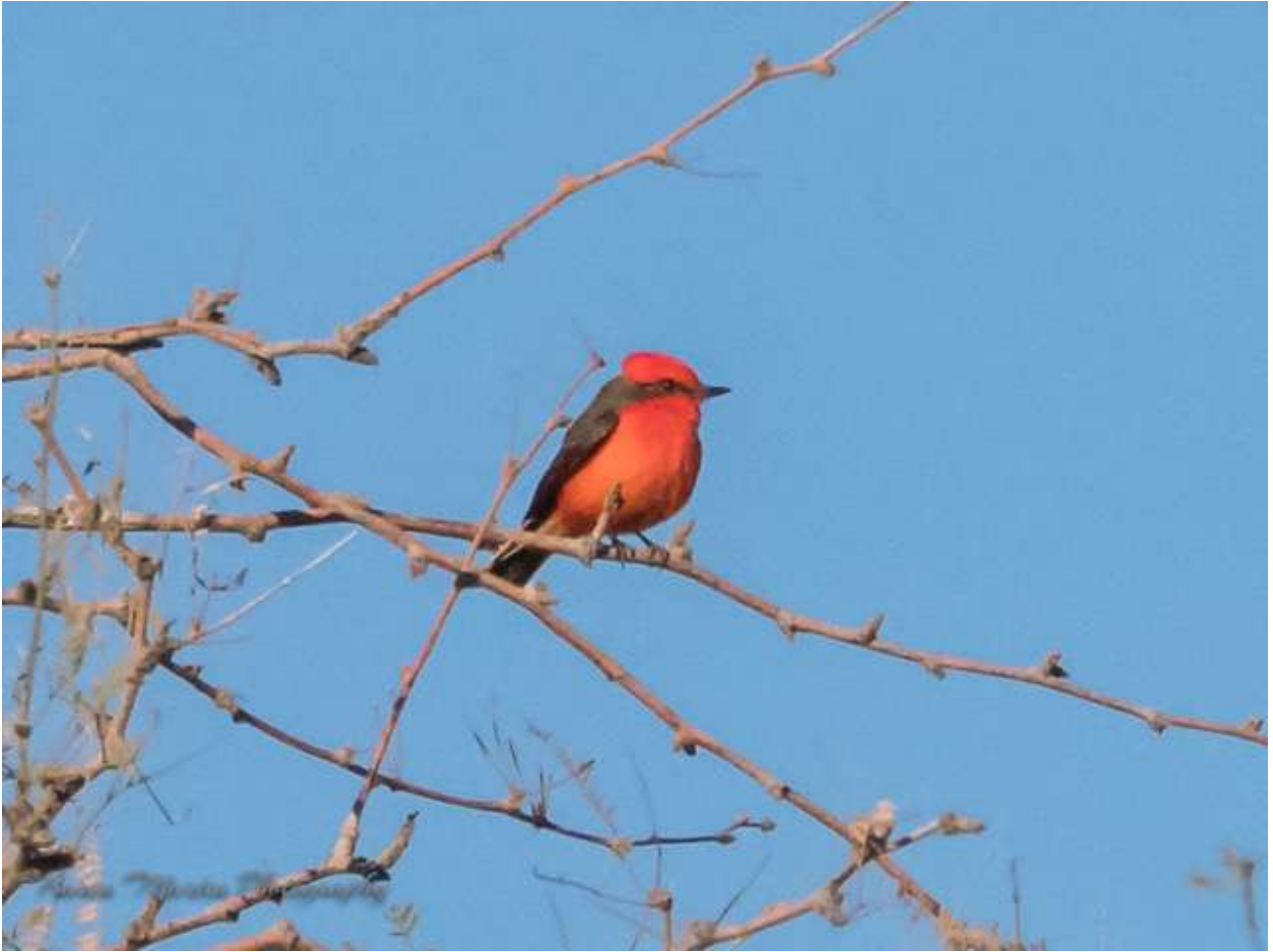
VERMILION FLYCATCHER MALE