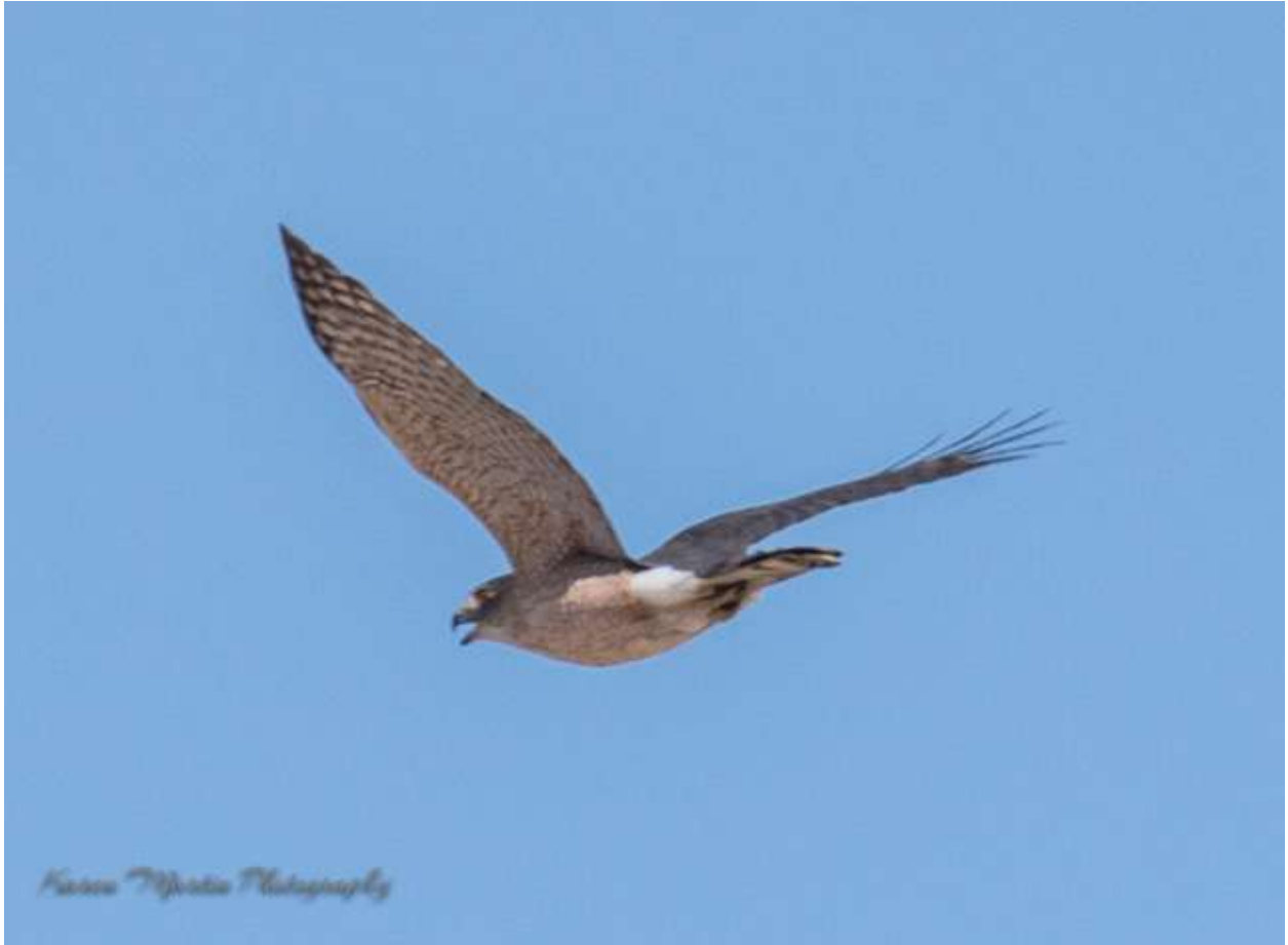
COOPER'S HAWK IN FLIGHT