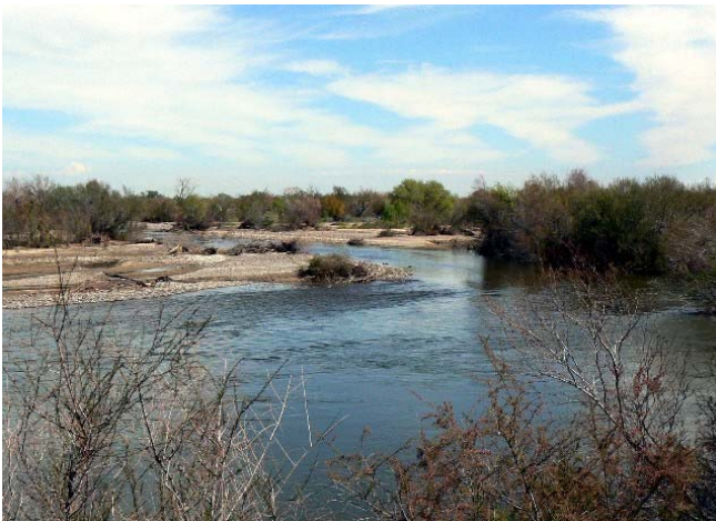
Gila River at Estrella Mountain Park - Tres Rios Festival March 10, 2010

See the website at www.tresriosnaturefestival.com for all the activities, vendors, etc.