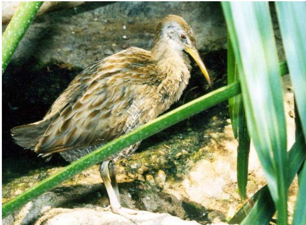
Yuma Clapper Rail

The effect of climate change on the Colorado River has implications for the sustainability of human habitat as well as Yuma clapper rail habitat. Control and diversion of this great river has enabled humanity to establish huge population centers in the arid southwest, but in January 2008 a paper by scientists at the Scripps Institute of Oceanography predicted a 50% chance that Lakes Powell and Mead will be dry by 2021. Over-allocation of water and reduced run-off due to climate change are issues that need to be addressed for the long-term viability of the Lower Colorado River and those who depend on it, from Yuma Clapper Rails to humans.