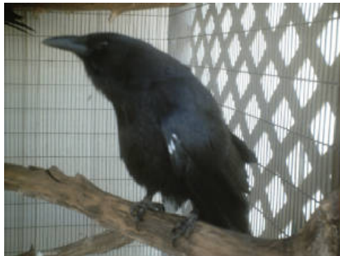
Morrigan the Crow and Spirit the Dove