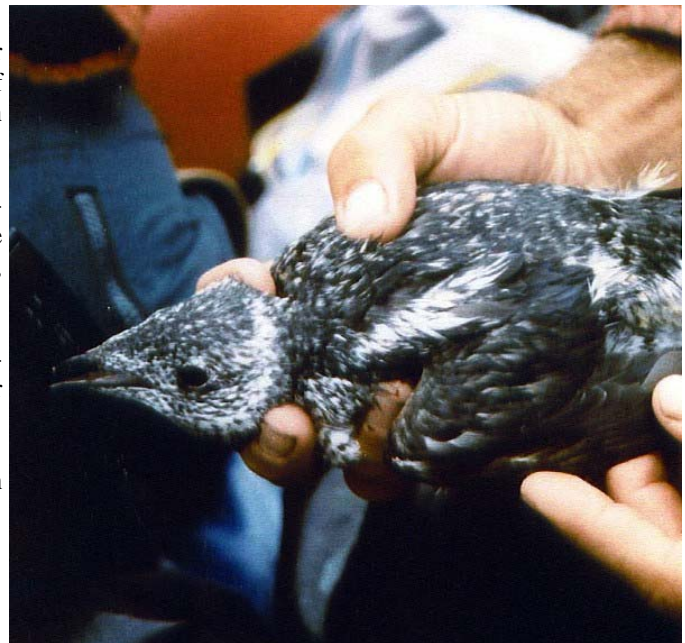
Kittlitz's Murrelet pictured at right

Come out and see one of our own in what should be an exciting program.