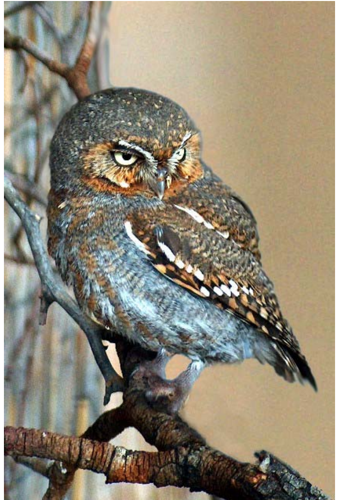
Elf Owl

Saguaros provide nesting habitat, food, and shelter for a multitude of desert creatures. These magnificent saguaro forests, which can take a century or more to recover, can be destroyed almost instantly by buffleggrass and other invasives. Learn more by visiting National Audubon’s Watchlist online, and to find out more about invasive species in the Sonoran desert check www.desertmuseum.org/invasives .