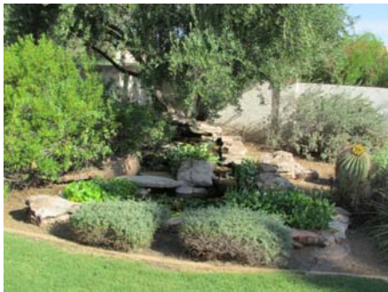
Backyard Pond Area

We just eliminated the large lawn area in the front yard and went with Xeriscape. The project was completed a few weeks ago and so it looks rather barren. There are four new trees—foothills palo verde, sweet acacia and two cascalote—plus various mostly native plants. We kept the desert willow and the Indian fig plants in the east side yard. We have just five feet of land on the west side but we did add a couple of jojoba to supplement the established cassia as screening from the next door neighbor. There is a large oleander tree over the driveway, also dating back to when we came here.