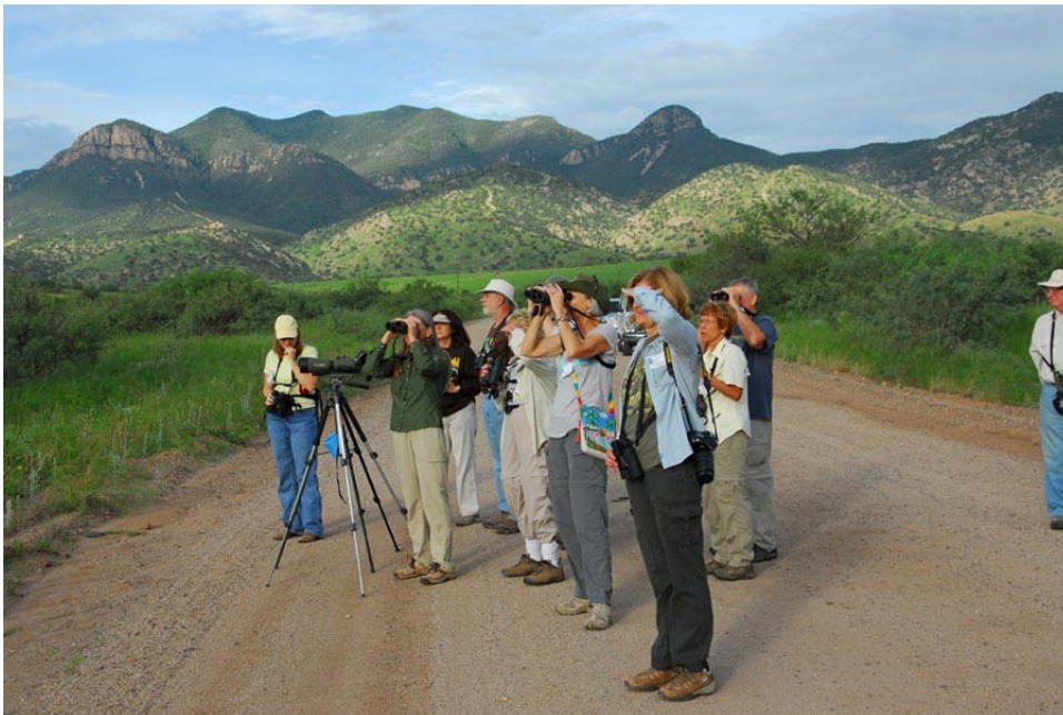
This picture was taken of the Huachuca Specialties tour—I am in the blue shirt shading my eyes