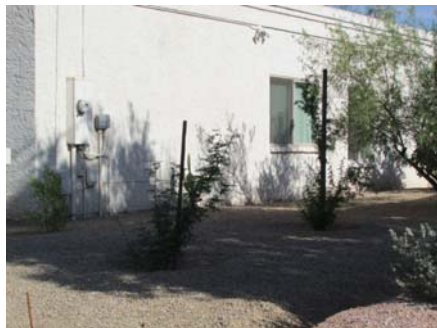
East Side of House