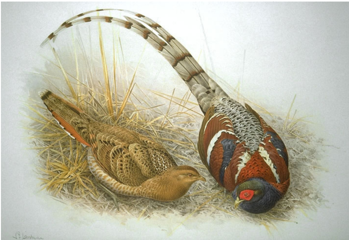
Mrs. Hume's Pheasant, also known as Hume's Pheasant or Bar-tailed Pheasant