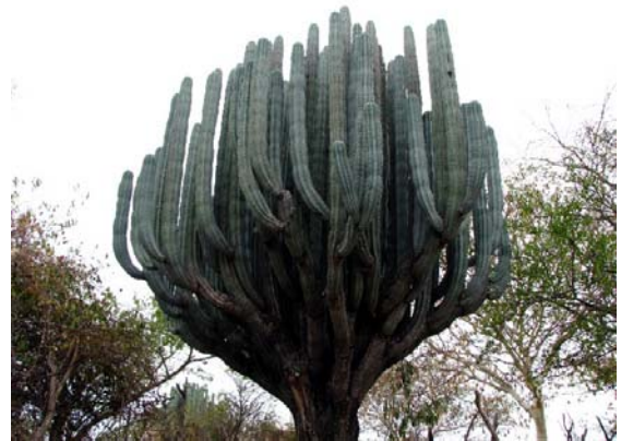
The Mata Rata tree only grows in volcanic soil