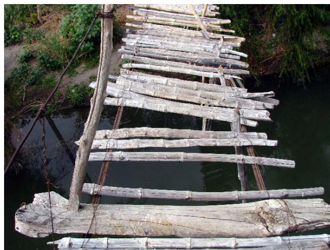
Frank Insana is on a precarious bridge, but this shortcut bridge from the ranch to the village takes all.