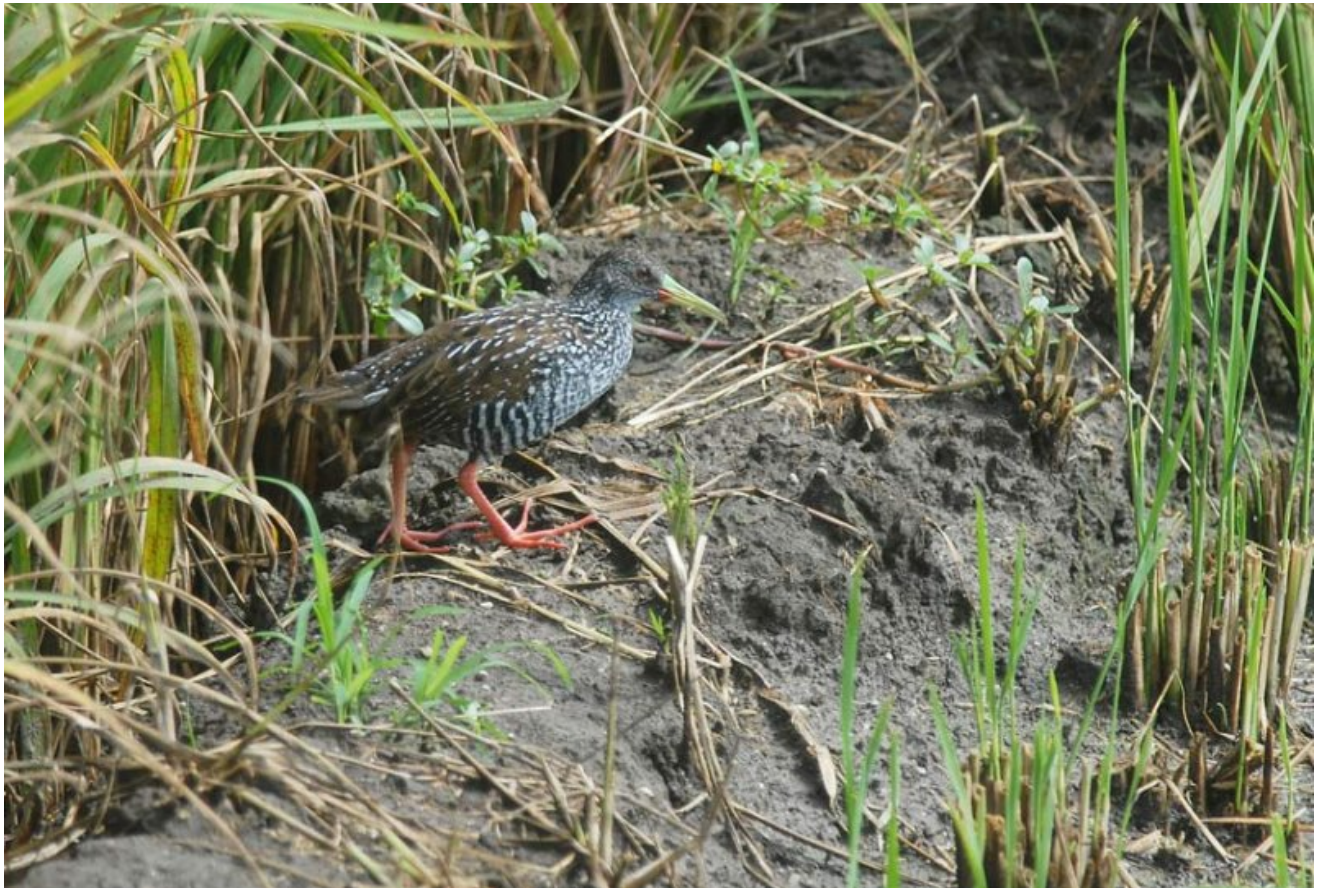
Spotted Rail