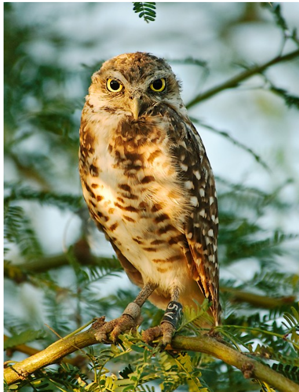
Burrowing Owl

Protecting grassland and desert scrub habitats from development and restoring native rodent populations are priorities for burrowing owl conservation. When relentless development overtakes their homes, the efforts of Wild at Heart and volunteers help to ensure that these fascinating owls continue to be our neighbors in the Phoenix area