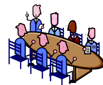
Planning for the Future