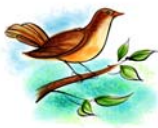
IBA Counts & Trips

Membership: Recruit new board members; recruit membership in new geographic areas like Surprise, Wickenburg, Good-year, Hassayampa, etc.; offer to give programs in these areas; call new members and new Friends; pass out newsletters everywhere; provide a welcome packet to visitors; greet as many people as possible – make people welcome.