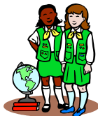
Scouting & Education