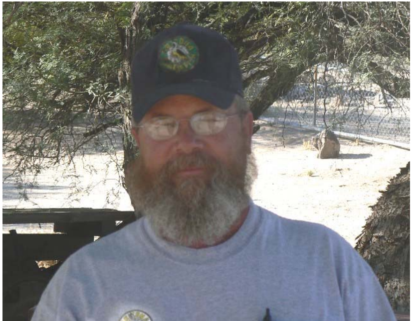
Phil Smith

vicinity. In addition, many raptors winter in and near RBWA, including the White-tailed Kite ( Elanus leucurus ). The summer avian community has not been counted, but species numbers probably exceed those of winter.