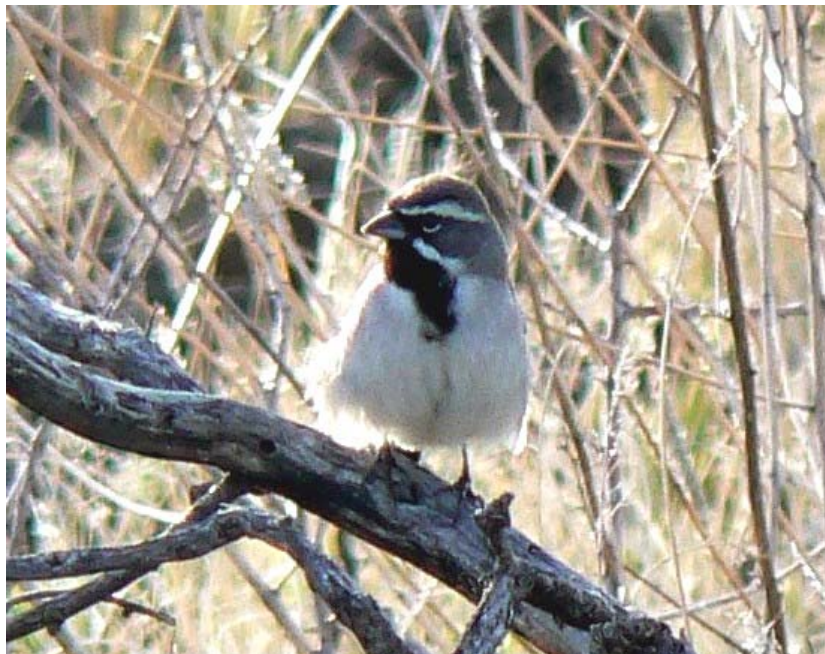
Black-throated Sparrow

Twenty million is a lot of black-throated sparrows, but the precipitous decline of our desert sparrow is a warning about the changes in our environment and a call to action for protecting our desert ecosystems.