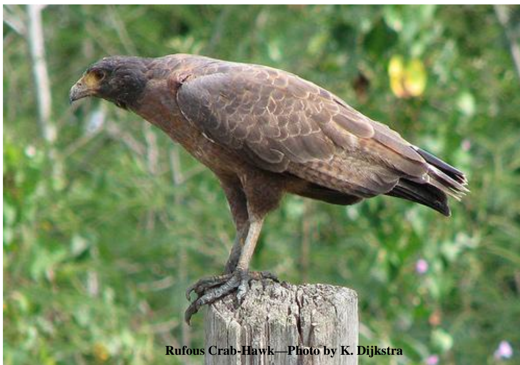
Rufous Crab-Hawk

We now knew the full story of the Rufous Crab-Hawk/tree crab predator/prey relationship that unfolds each day in the mangroves of northeast Venezuela.