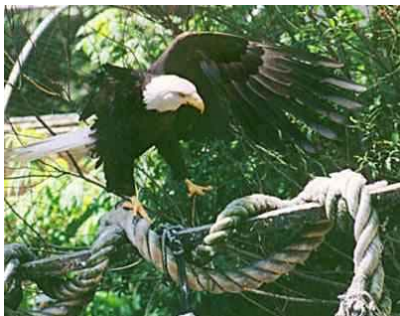
Eagle with missing wing

SAS Web Site: www.sonoranaudubon.org Arizona Audubon Web Site: www.az.audubon.org Desert Rivers Audubon Web Site: www.desertriversaudubon.org Maricopa Audubon Web Site: www.maricopaaudubon.org Arizona Field Ornithologists: www.azfo.org National Audubon: http://audubon.org/