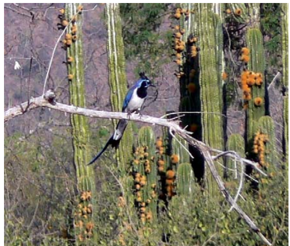
Black-throated Magpie Jay—Alamos—by George Wall

Come on out or give them a call at 623-773-3000 or go to their website at http://glendale.wbu.com/