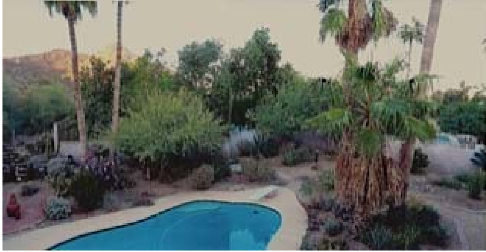
Backyard and Panoramic View