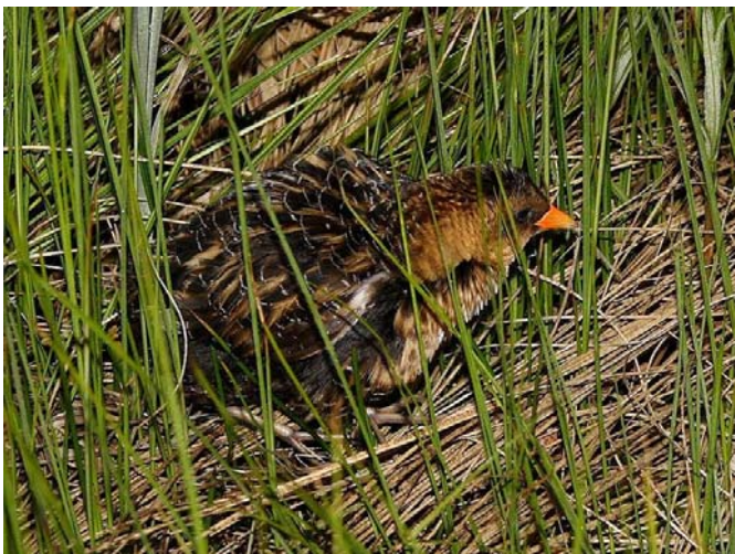
Yellow Rail

The Yellow Rails are always uncommon and secretive and are small (slightly over seven inches). Adults have brown upperparts streaked with black, a yellowish-brown breast, a light belly and barred flanks. The short thick dark bill turns yellow in males during the breeding season. The feathers on the back are edged with white. There is a yellow brown band over the eye and the legs are greenish-yellow. In flight, it shows a distinctive large white wing patch on the trailing edge of each wing. The familiar call, heard chiefly in breeding season, sounds like tapping two pebbles together.