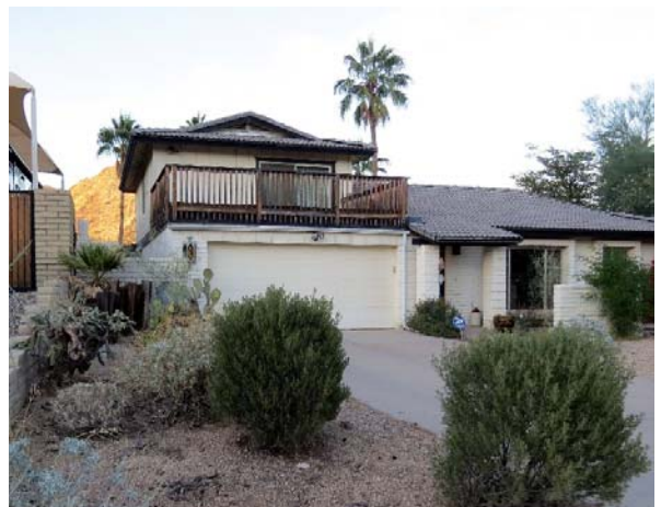
Left side of the front yard

This is pure delight, in the middle of urban Phoenix, to have nourished a space that works so well for our native desert birds.