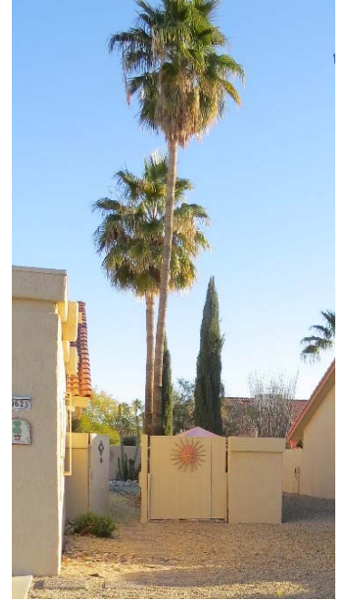
View into Backyard