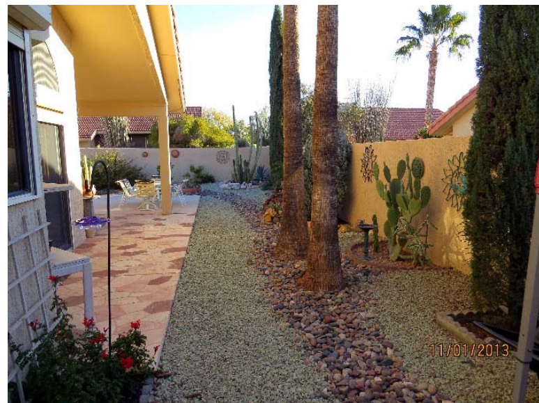
One side of his Backyard

He has several feeders including two for hummingbirds. He has a beautiful water fountain. What more could birds want.