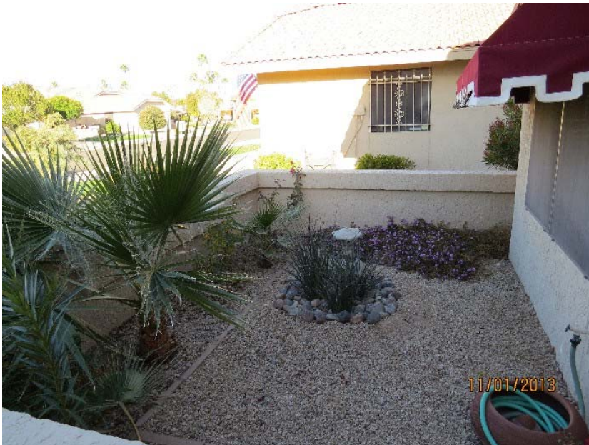
Just a Few of His Front Yard Plants

With a backyard like this that lies between two golf courses, it's no wonder that birds flock to his yard.