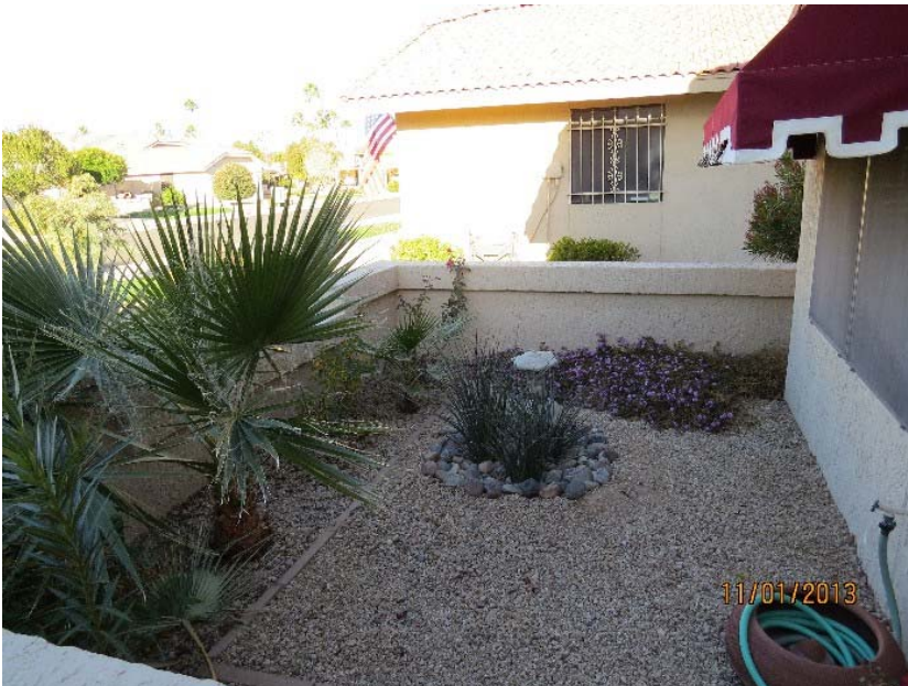
Just a Few of His Front Yard Plants

With a backyard like this that lies between two golf courses, it's no wonder that birds flock to his yard.