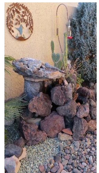
Fountain with running water

Well, Jim is not finished as he explained several ideas to me. They included creating rock formations, potted plants, more seedlings and other things to create more shelter and nesting spots for birds.