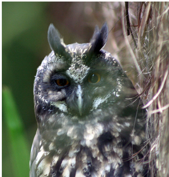
Stygian Owl

The Stygian Owl is a bird of the forests, often high in the mountains, but shows a remarkable adaptability in its behavior. It has been found in both humid and semi-arid forests, in tropical rain-forest and in low, thorny bush country. Its nocturnal behavior may disguise the fact that it is commoner than is generally believed. It, like the Long-eared Owl, occupies a very