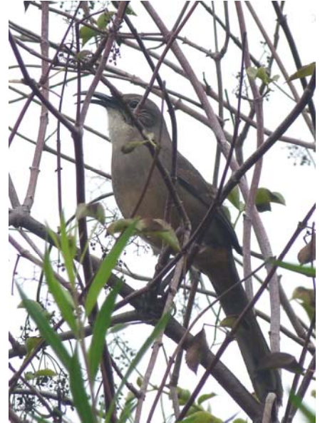
The Sanctuary and one of the birds I saw there—a California Thrasher