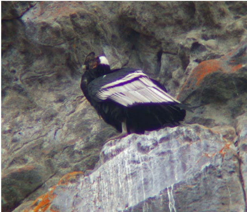
Andean Condor

The Andean Condor's habitat is mainly composed of open grasslands and alpine areas up to 16,000 feet in elevation. It prefers relatively open, non-forested areas which allow it to spot carrion from the air. On wing, the movements of the condor are remarkably graceful as it wheels in majestic circles, with wings held horizontally and its primary feathers bent upwards at the tips. It flaps its wings on rising from the ground and relies on thermals to stay aloft. Condors often travel more than 120 miles a day in search of carrion. They prefer large carcasses, such as deer, or beached marine mammals. They may follow other scavengers who may have located a carcass by smell, and then dominate the carcass. Condors play an important role in the ecosystem by disposing of carrion which would otherwise be a breeding ground for disease.