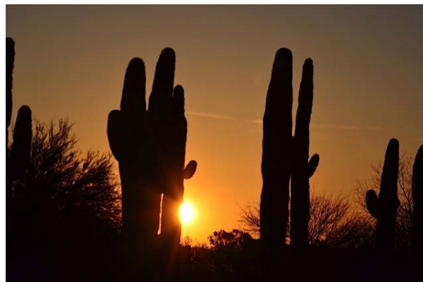
taken at the Gilbert Water Ranch

Desert Botanical Garden entrance fees of $15.00 ($13.50 seniors) apply unless you're a DBG member. Membership is $75 a year. When special events are held, the entry fee could be higher. See their website at www.dbg.org for further information.