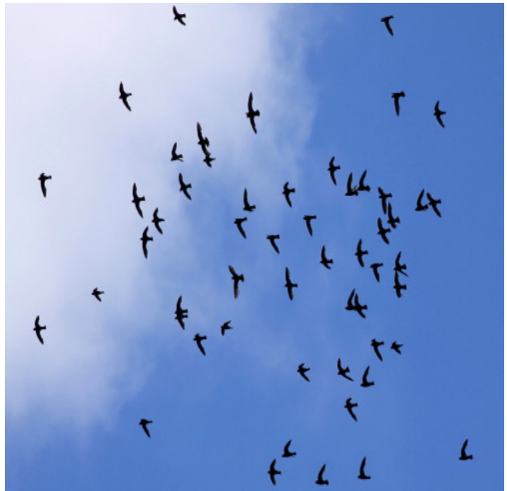
Flock of White-naped Swifts—Photo taken in Cuernavaca, Mexico by Bjorn Anderson

In most bird species, feet are a necessity for either perching or catching prey. Swifts prove that a bird can live “without feet” if it has superlative flying abilities.