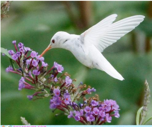
Albino Ruby-throated Hummingbird

While walking in a park in Staunton, Virginia, he saw a hummingbird flitting among the flowers. Using his Canon EOS1D Mark 4 with a 600ml F4 lens, he snapped a series of pictures (one shown below). It was only when he showed the pictures to his dad that he found out it was an extremely rare albino Ruby-throated Hummingbird. Its unusual pink eyes, feet and beak are caused by blood vessels exposed because of the bird's lack of melanin - a chemical that normally gives feathers their color.