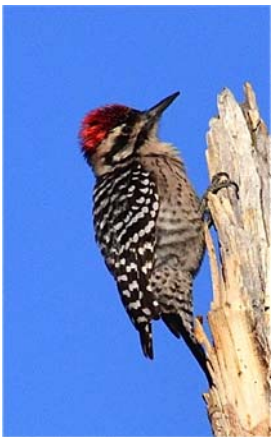
Ladder-backed Woodpecker

Although she worked full time for various firms in Manhattan, she took trips with professional birders and acquired a life list of 595 species. She took early retirement after 25 years with ConEd and moved to Arizona 10 years ago. Here she's been active in the Birders Anonymous group as well as a friend of Sonoran Audubon Society. She's a member of National Audubon Society and is especially interested in animal rights with membership in PETA, Animal Rights Society of the United States, Arizona Humane Society and the Humane Farming Association. As a member of the Sonoran Audubon Society, she's a member of an IBA team for the Arlington Wildlife Area.