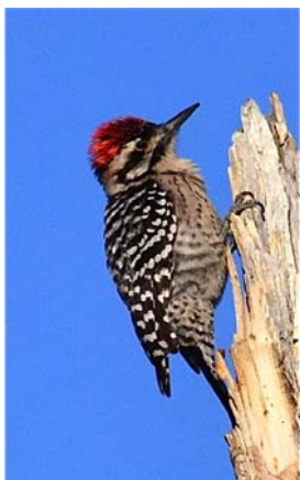
Ladder-backed Woodpecker

Although she worked full time for various firms in Manhattan, she took trips with professional birders and acquired a life list of 595 species. She took early retirement after 25 years with ConEd and moved to Arizona 10 years ago. Here she's been active in the Birders Anonymous group as well as a friend of Sonoran Audubon Society. She's a member of National Audubon Society and is especially interested in animal rights with membership in PETA, Animal Rights Society of the United States, Arizona Humane Society and the Humane Farming Association. As a member of the Sonoran Audubon Society, she's a member of an IBA team for the Arlington Wildlife Area.