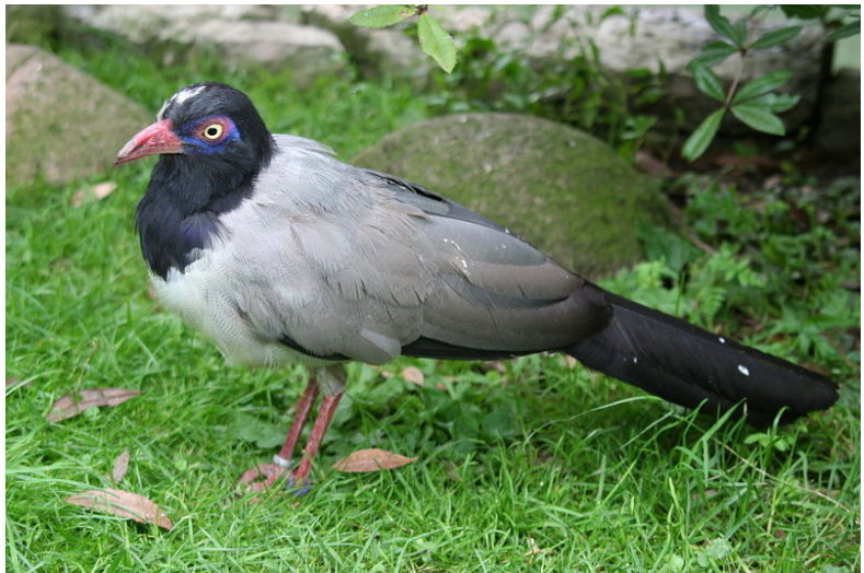
Coral-billed Ground Cuckoo

In addition to birds, there are many other creatures in Thailand. Insects are prevalent, although we mostly saw only butterflies. People in Thailand enjoy insects as a snack food, often enjoyed with beer. Maybe this custom could become a Super Bowl tradition here! There are over 145 species of snakes in Thailand (45 poisonous). We saw only one, a small black-and-yellow banded variety, that bit our guide’s shoe on an owling evening. Of the 310 species of reptiles, we saw several huge monitor lizards, both river and forest varieties, as well as bedroom-friendly geckoes and a flying lizard. Of the 264 mammal species, we saw several deer (Sambar, Barking), elephants, Macaques (pig-tailed and long-tailed), the charming White-handed Gibbon, and the rarely-seen, nocturnal Binturong, a member of the Civet family.