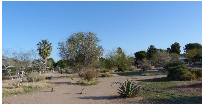
Side Yard Facing North

When I visited their home and took these pictures (except for the Pyrrhuloxia ), I was amazed at all of their cacti, flowering plants, and trees designed to attract birds in their front yard, backyard and side yard and they are firm believers in native plants.