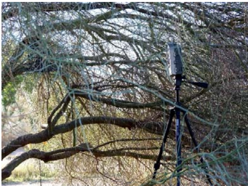
One of two sensor cameras

They bought their house and two acres of land 40 years ago. They first had a lot of animals on their property, but in time they sold the animals and started in on designing their backyard habitat. In 1988, they got their yard certified by the National Wildlife Federation as a Wildlife Habitat.