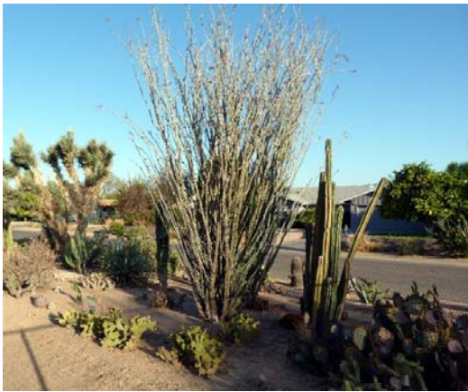
Front Yard Facing Northeast