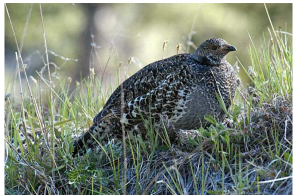
Male Blue Grouse