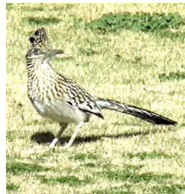
Greater Roadrunner

Arlene and Alvin Scheuer: "Nesting Roadrunners"