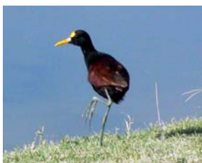
Northern Jacana at Casa Grande, AZ