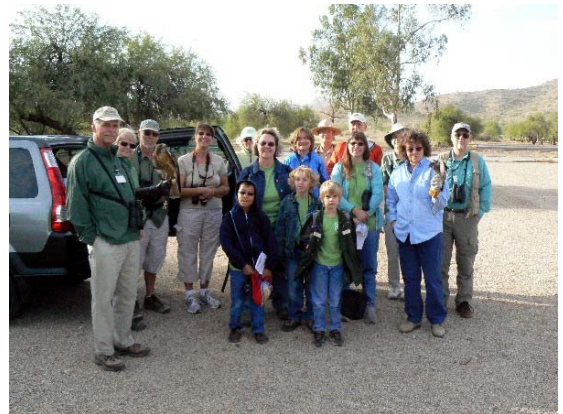
Estrella Mountain Park Family Bird Walk

It was a windy morning and the birds were hunkered down; still, we managed to see some nice species that included Lark Sparrows, a female Vermilion Flycatcher and a beautiful male Red-naped Sapsucker.