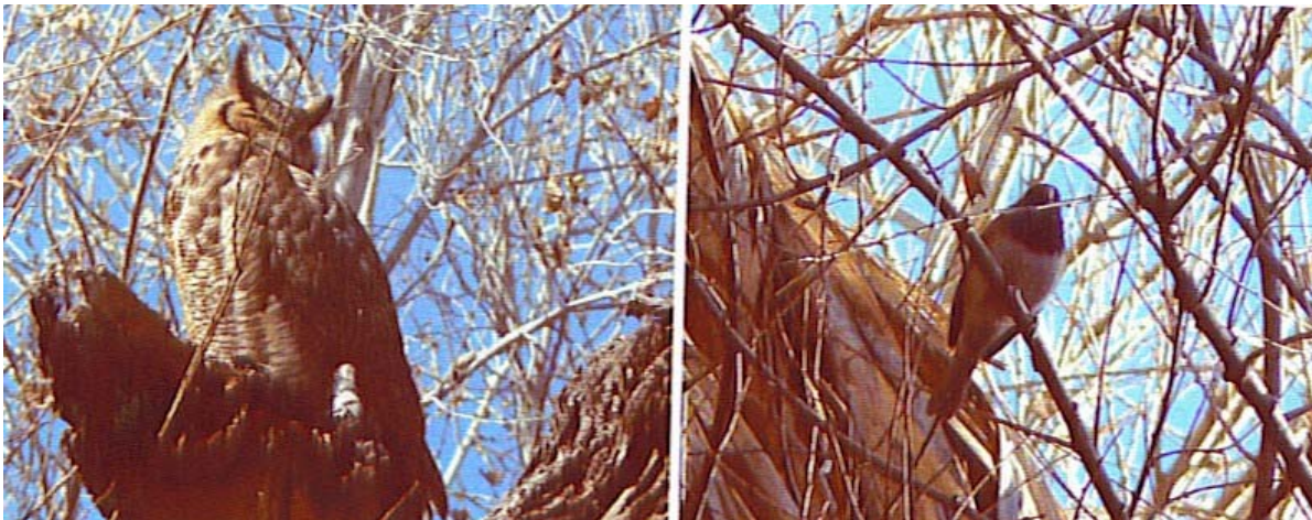
Great Horned Owl & Dark-eyed Junco (Oregon)

Before and after the Retreat, there were bird walks around the trails at Hassayampa. Here's a list of the 42 species of birds seen or heard: Great Blue Heron, Ring-necked Duck, Sharp-shinned Hawk, American Coot, Gambel's Quail, Mourning Dove, White-winged Dove, Greater Roadrunner, Great Horned Owl, Anna's Hummingbird, Gila Woodpecker, Red-naped Sapsucker, Ladder-backed Woodpecker, Northern Flicker, Black Phoebe, Say's Phoebe, White-throated Swift, Ruby-crowned Kinglet, Phainopepla, Rock Wren, House Wren, Canyon Wren, Western Bluebird, Hermit Thrush, Northern Mockingbird, Blue-gray Gnatcatcher, Bridled Titmouse, White-breasted Nuthatch, Brown Creeper, Verdin, Common Raven, House Sparrow, Plumbeous Vireo, House Finch, Pine Siskin, Lesser Goldfinch, Yellow-rumped Warbler, Spotted Towhee, Abert's Towhee, Song Sparrow, Dark-eyed Junco (Oregon) and Northern Cardinal.