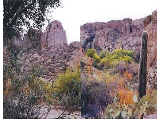
Scenic View at Boyce Thompson Arboretum

Boyce Thompson Arboretum is now in their Fall/Winter schedule. They have bird walks and other programs. Their hours are 8:00 a.m. to 5:00 p.m. each day. The price of admission is $7.50 for adults and $3 for children ages 5-12. For driving directions or other details, call 520-689-2811 or visit their internet website at http://cals.arizona.edu/BTA/