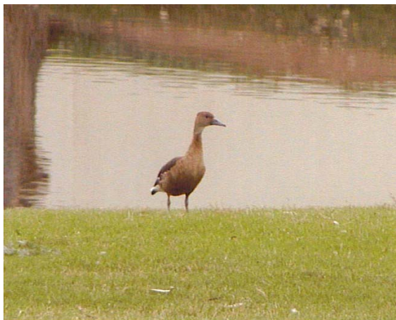
Fulvous Whistling Duck

45 - November 4, 2006 – Greater White-fronted Goose