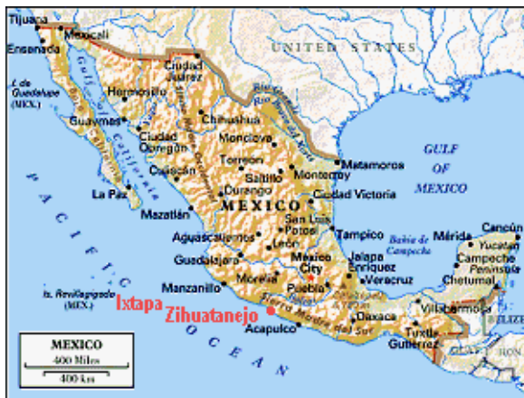
Map of Mexico showing Zihuatanejo on the coast

Zihuatanejo is a quaint fishing pueblo but only four miles away from the tourist center of Ixtapa. You might say they are contrasting twin towns. One is bold, beautiful and full of action, and the other is a quiet wallflower. Between the two towns, that are set in the lush valley of the Southern Sierra Madre and run along 16 miles of coastline, there are 85,000 people living there.