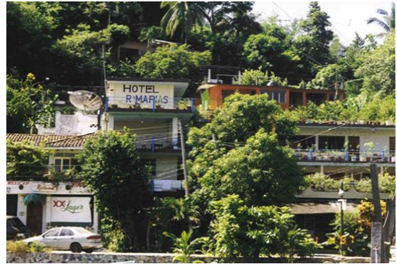
Our hotel and balcony amid lots of trees

of the Raul Tres Marias Hotel. The best viewing times were from dawn until 9 a.m. and then again just before sunset, but all day long the Magnificent Frigatebirds circled high in the sky and sometimes even disappeared to the naked eye and even from your binoculars.