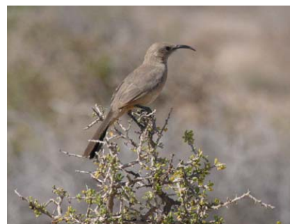
Vizcaino [Le Conte's] Thrasher

Considered a subspecies of Le Conte's Thrasher, quite possibly a full species.